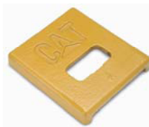
Solid Wear Plate