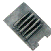
Plug For Retainer